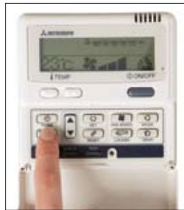
RCE1 Wired Controller