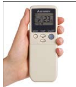
Optional 'Wireless' Controller

Energy Saving up to 38% with INVERTER Technology