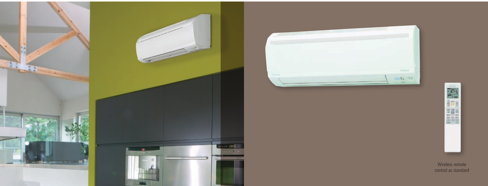
Wireless remote control as standard